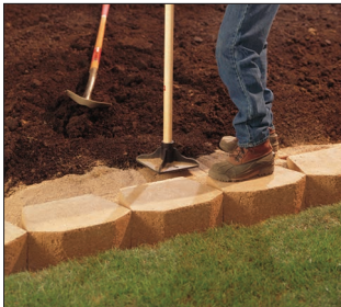
2. Place & Compact Backfill