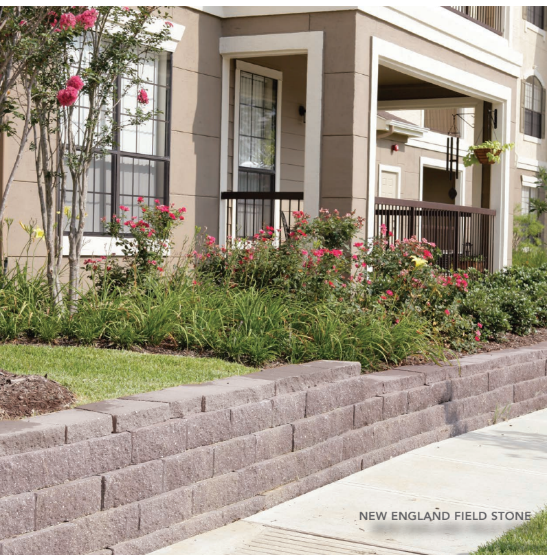
NEW ENGLAND FIELD STONE