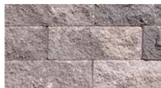
New England Field Stone