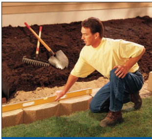
1. Prepare Wall Location