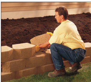
3. Install Additional Courses