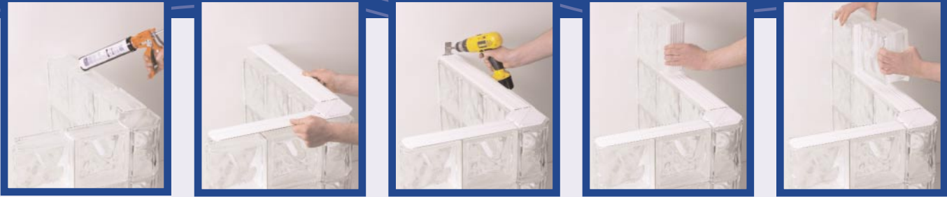
Above photo series: ProVantage® Glass Block Installation System using HEDRON® Block.