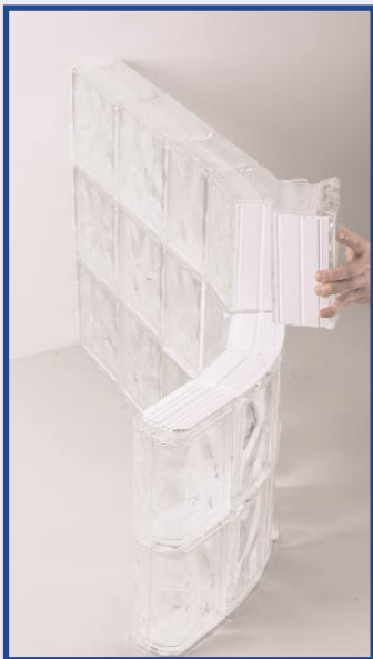
ProVantage® Glass Block Installation System using ARQUE® Block.

A combination of the above items will be needed depending upon your design.