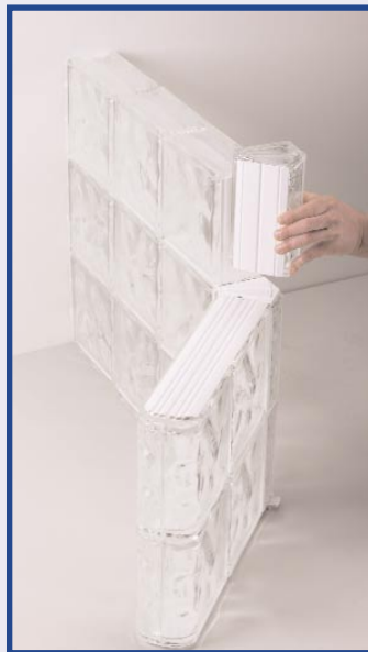
ProVantage® Glass Block Installation System using TRIDRON® Block.

The ProVantage™ Glass Block Installation System is available through authorized Pittsburgh Corning Glass Block Distributors. For more information on Pittsburgh Corning Glass Block products, contact the Pittsburgh Corning Glass Block Resource Center at 1-800-624-2120 or visit our website at www.pittsburghcorning.com